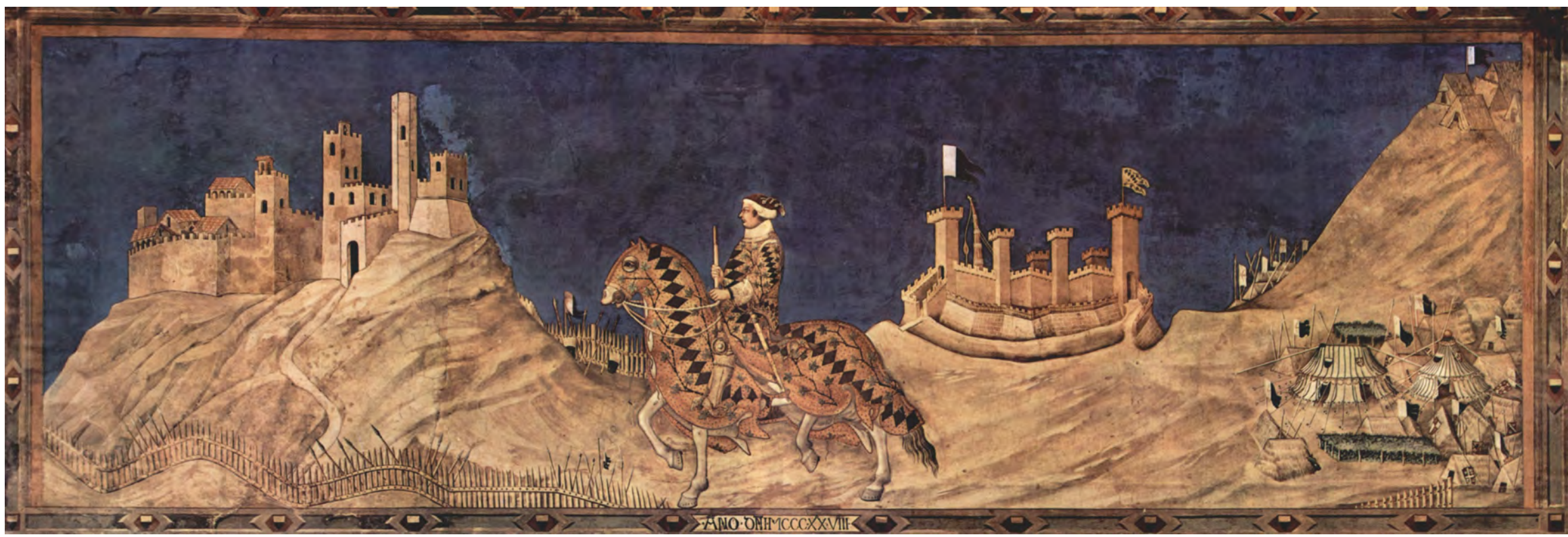
Simone Martini (1284 –1344) in Siena City Hall, The Equestrian portrait of Guidoriccio da Fogliano , 1330 commemorating the conquering of Montemassi Castle by the Sienese.

An artistic research between urban life and early renaissance imagery