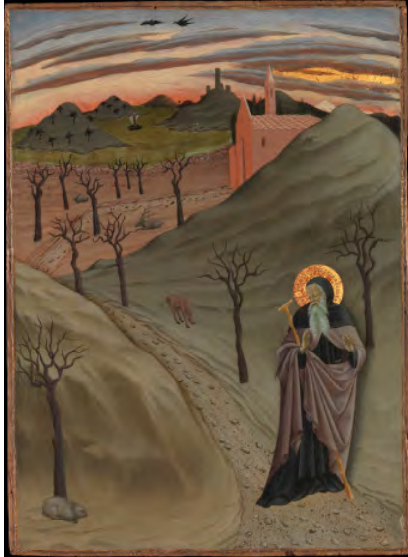
Osservanza Master, Saint Anthony the Abbot in the Wilderness , 1434, 18 3/4 x 13 5/8 in, The Metropolitan Museum of Art, New York

This panel is part of a cycle of scenes depicting the life of the hermit Saint Anthony the Abbot. The painter's penchant for original and descriptive narrative detail appears in the treatment of the desert landscape and its fauna (symbols of the saint's temptations) beneath the luminous sky at dusk. A pot of gold in the lower left corner (which has been scraped away) symbolized the seductive worldly goods that the stalwart saint resists. The series of eight panels were likely arranged vertically, surrounding a central painted or sculpted image of Saint Anthony. The complex was probably commissioned for a member of the Sienese Martinozzi family (whose arms appear on one of the panels) for an Augustinian foundation, either in Siena or perhaps in the Marches region, where several branches of this family were located.