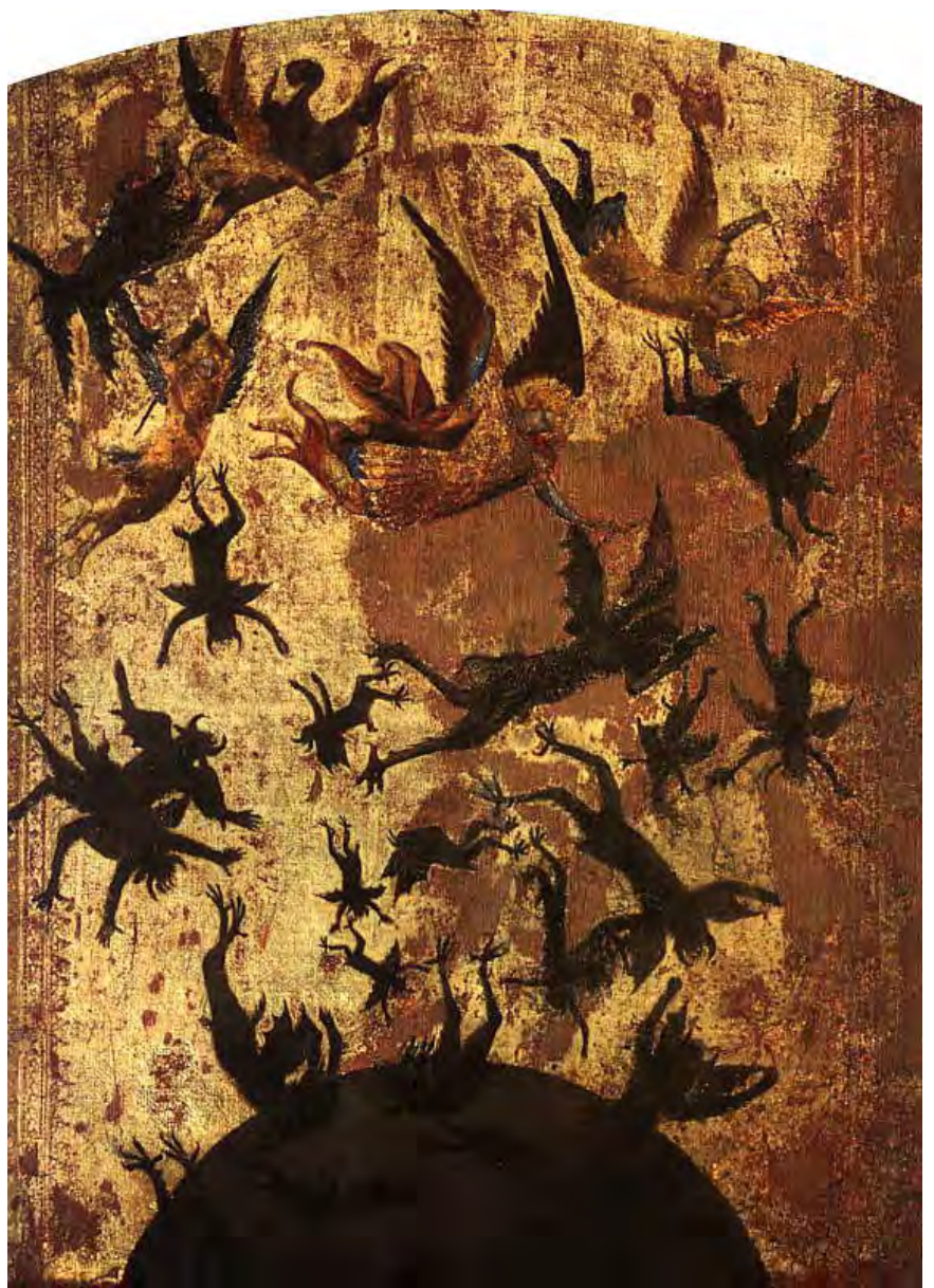
Unknown artist from the Sienese School, The Fall of the Rebel Angels , 1340-45, 25 x 11 in, Musée du Louvre, Paris