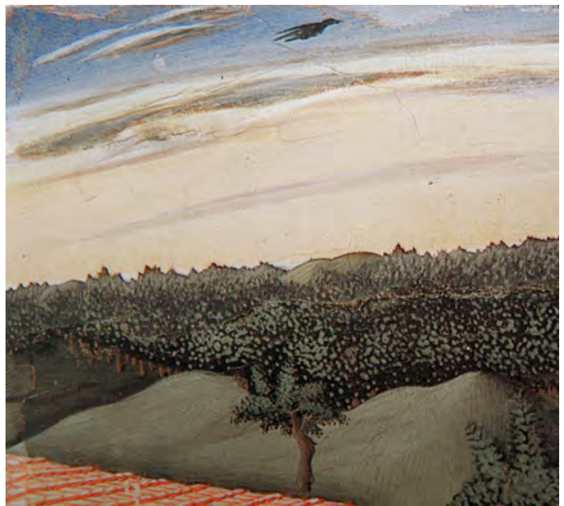
Master of the Osservanza, Saint Anthony tempted by the devil in the guise of a woman , 1435-40, 14.9 x 15.8 in, Yale University Art Gallery, Connecticut

One of the most admired narrative series in fifteenth-century Sienese painting comprises eight panels illustrating the legend of Saint Anthony the Abbot, generally attributed to an anonymous artist known only as the Master of the Osservanza. Originally part of an altarpiece, the series includes works now divided among museums in New York, Washington, D.C., and Berlin, in addition to the two panels in the Yale University Art Gallery's collection. In this panel, Saint Anthony, retiring to a life of abstinence and isolation, is beset with temptations of the flesh. The wings of the seductress at the right identify her as a devil concealing her true motives.