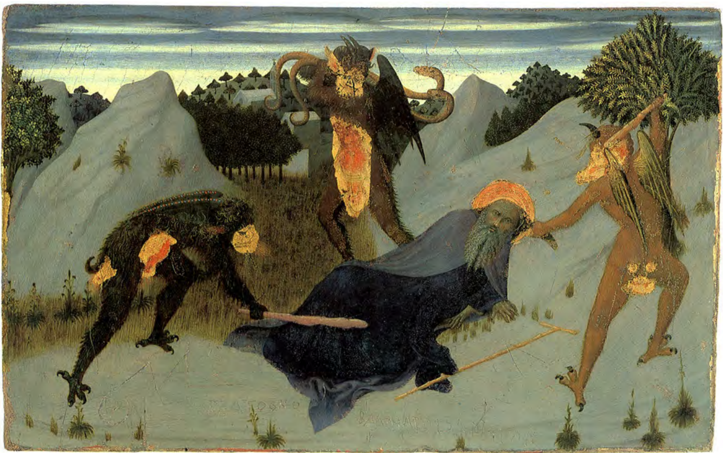
Sassetta, Saint Anthony Beaten by Devils , 1430-32, 9.4 x 15.4 in, Pinacoteca Nazionale, Siena

Stefano di Giovanni di Consolo, known as il Sassetta (ca.1392–1450) was an Italian painter who is considered one of the most important representatives of Sienese Renaissance painting. While working within the Sienese tradition, he innovated the style by introducing elements derived from the decorative Gothic style and the realism of contemporary Florentine innovators as Masaccio.