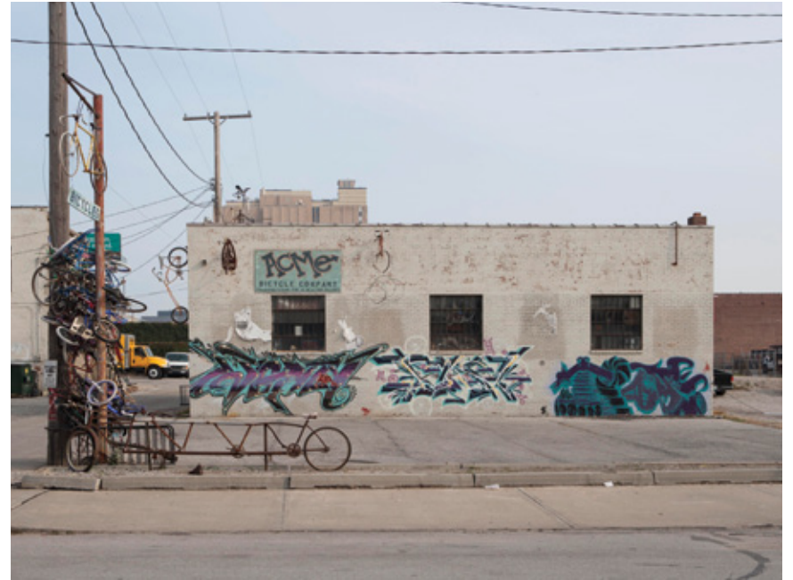
Acme Bicycle Company