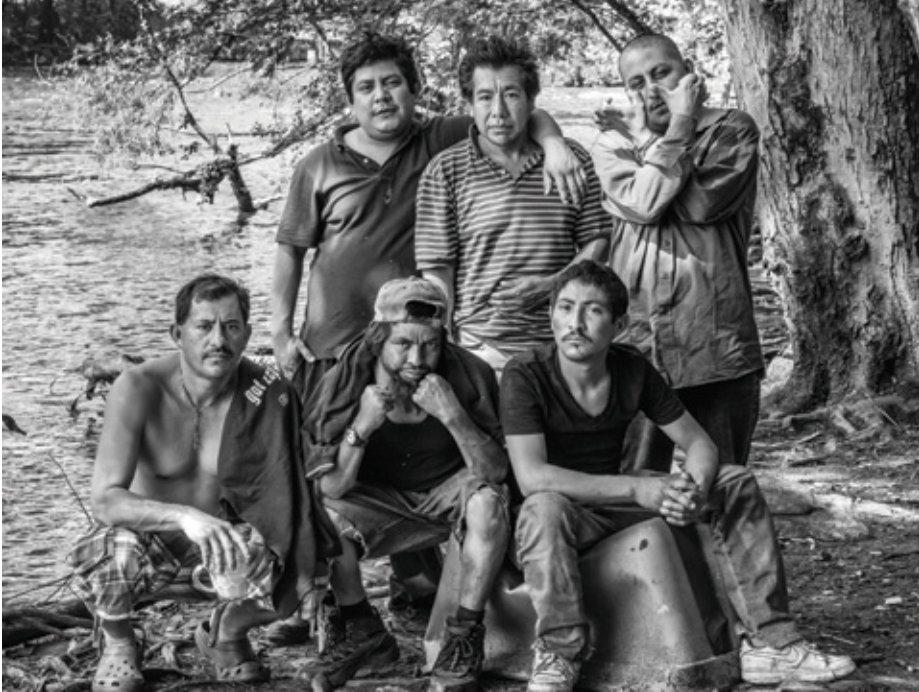
Group, Paterson, New Jersey