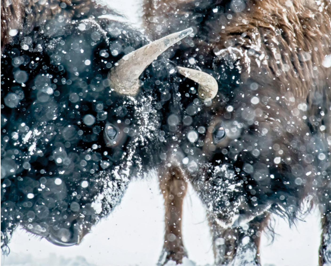
Sparring Bison, Yellowstone National Park