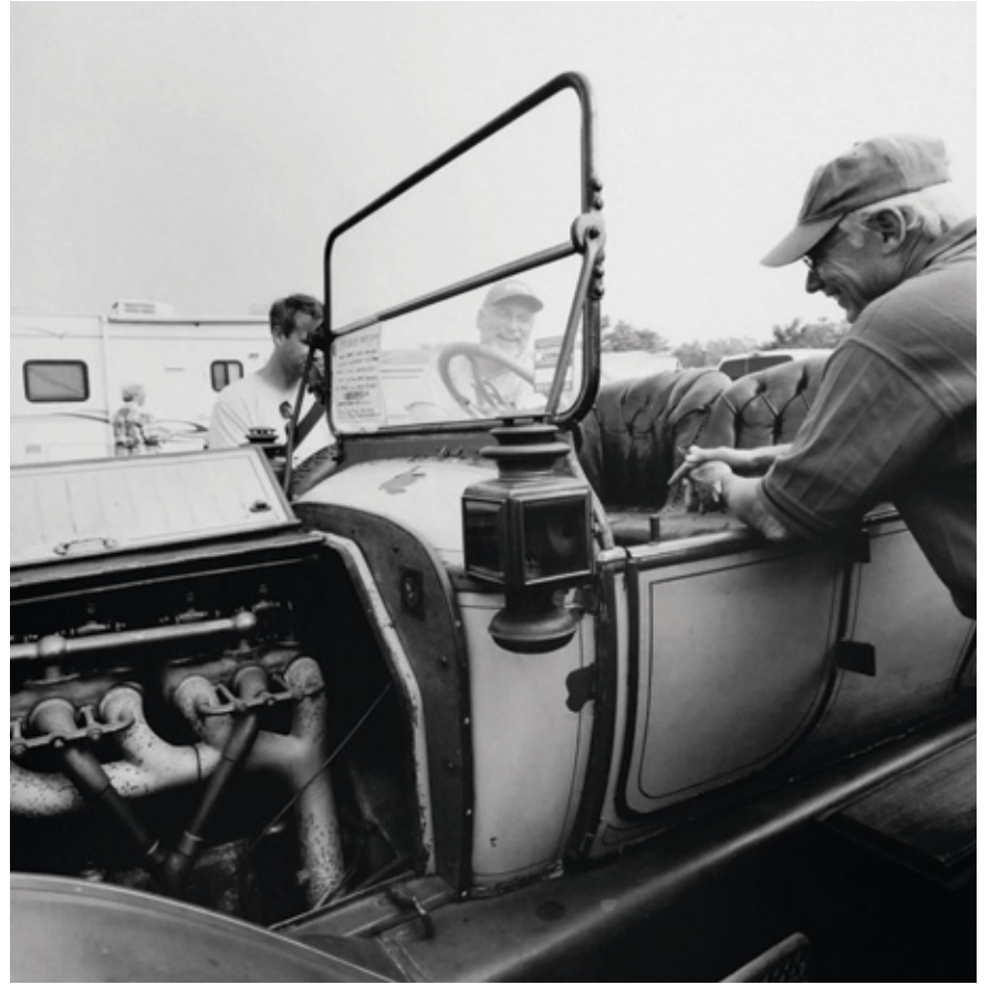
Two Friends with Early Car