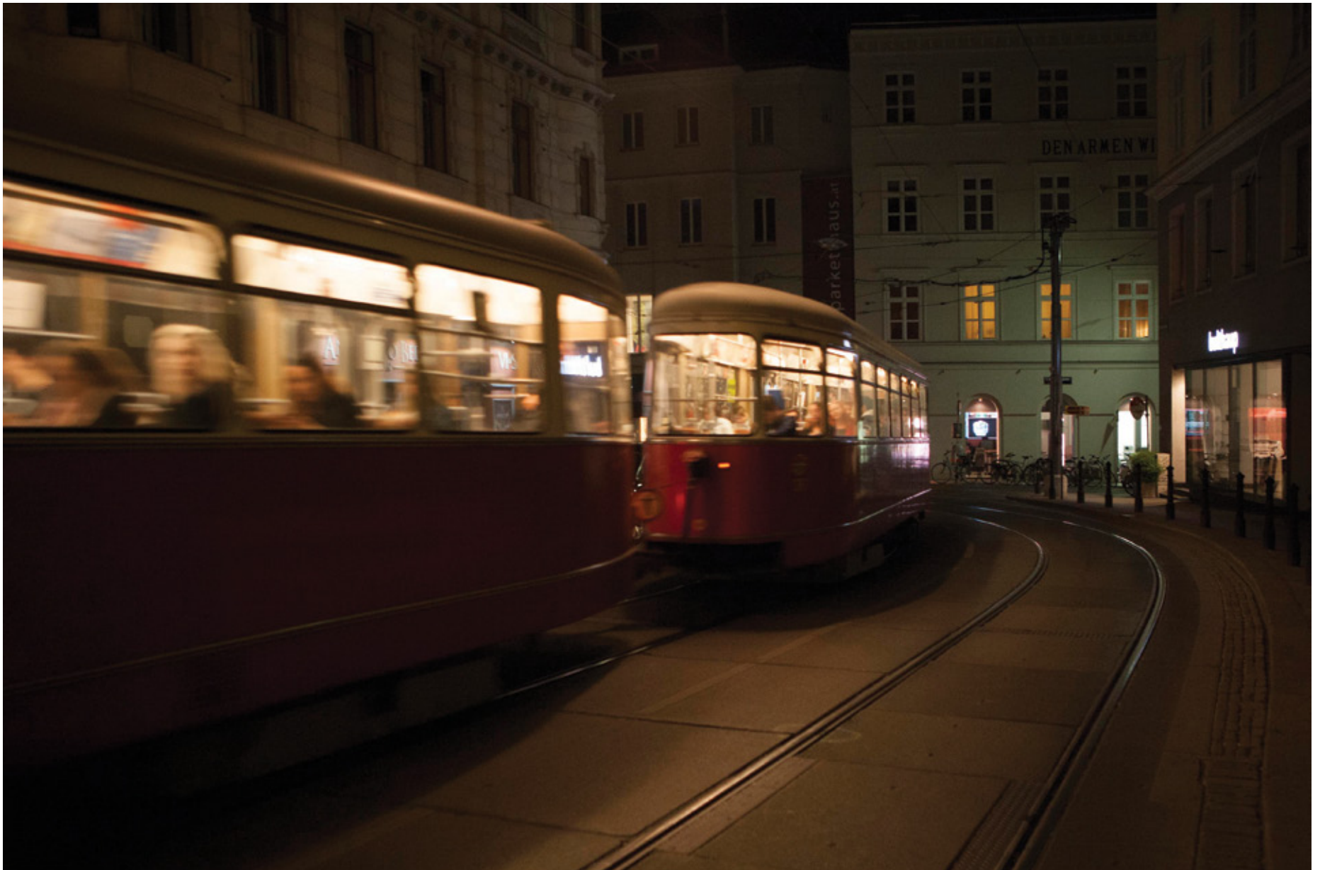
Viennese Street Cars with Passengers at Night