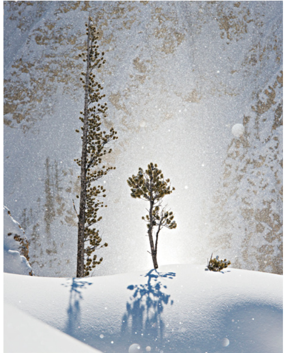
Trees and Snow Crystals, Yellowstone National Park