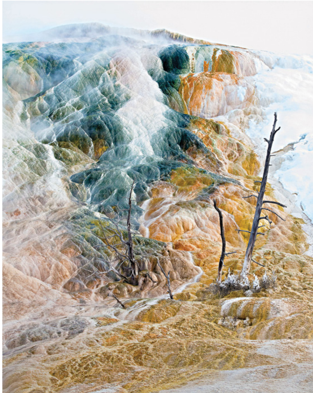
Mammoth Spring Trees, Yellowstone National Park