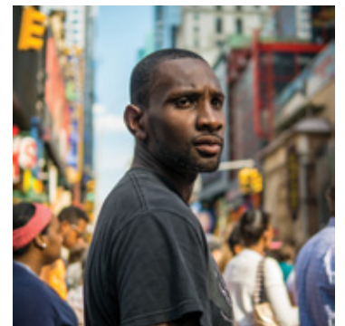
Evening Rush Hour, 42nd Street and 8th Avenue, North West Corner