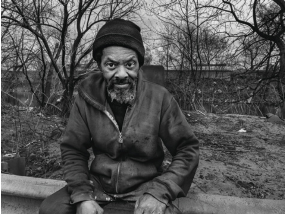
Shorty, Paterson, New Jersey