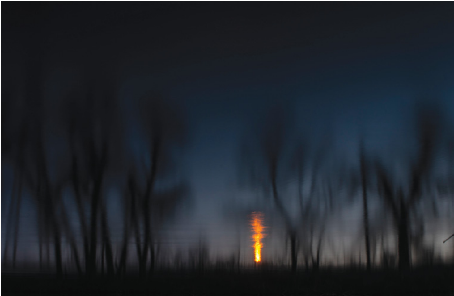
Our Mastery of the Elements