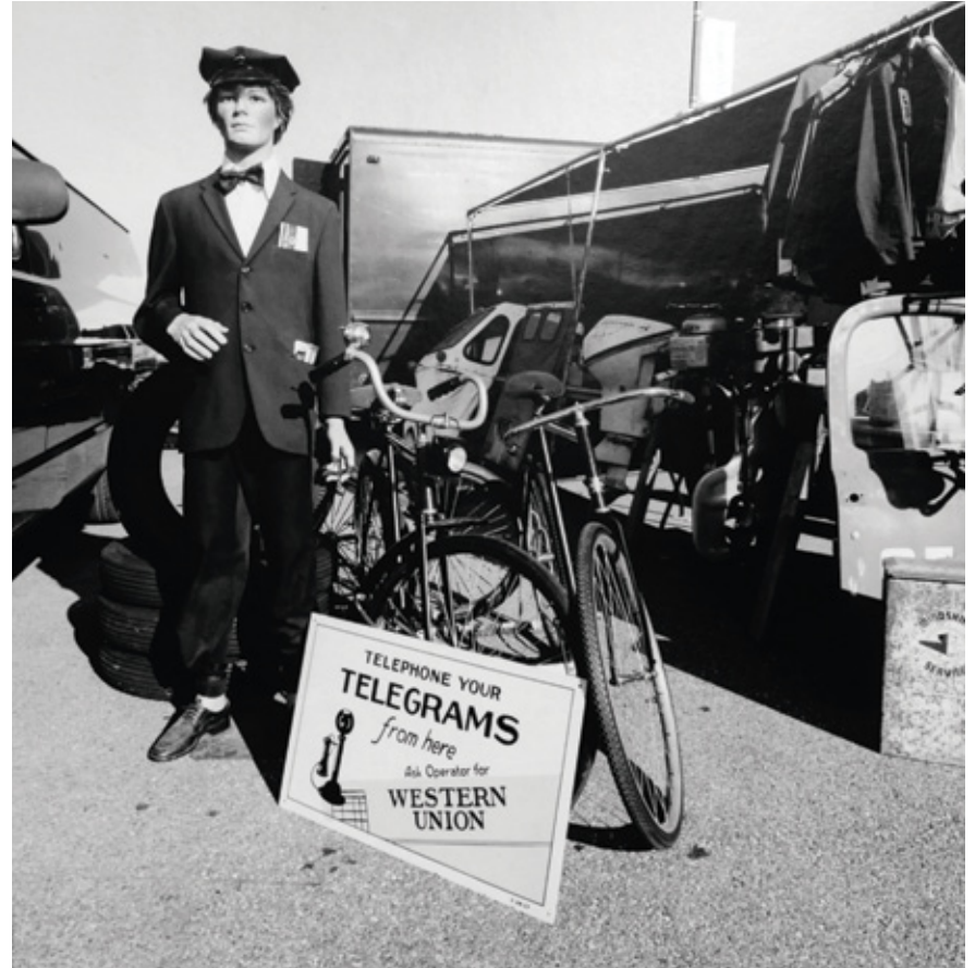
Manikin with Bicycles