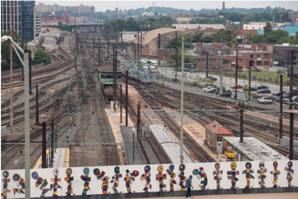
Union Station Rail Yard and Man with Cane