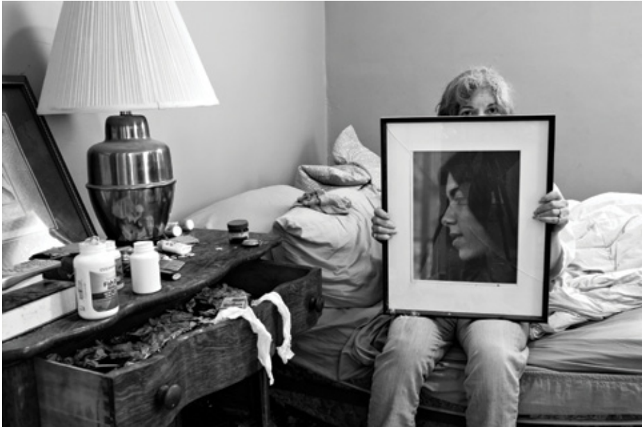
Amie with Amie