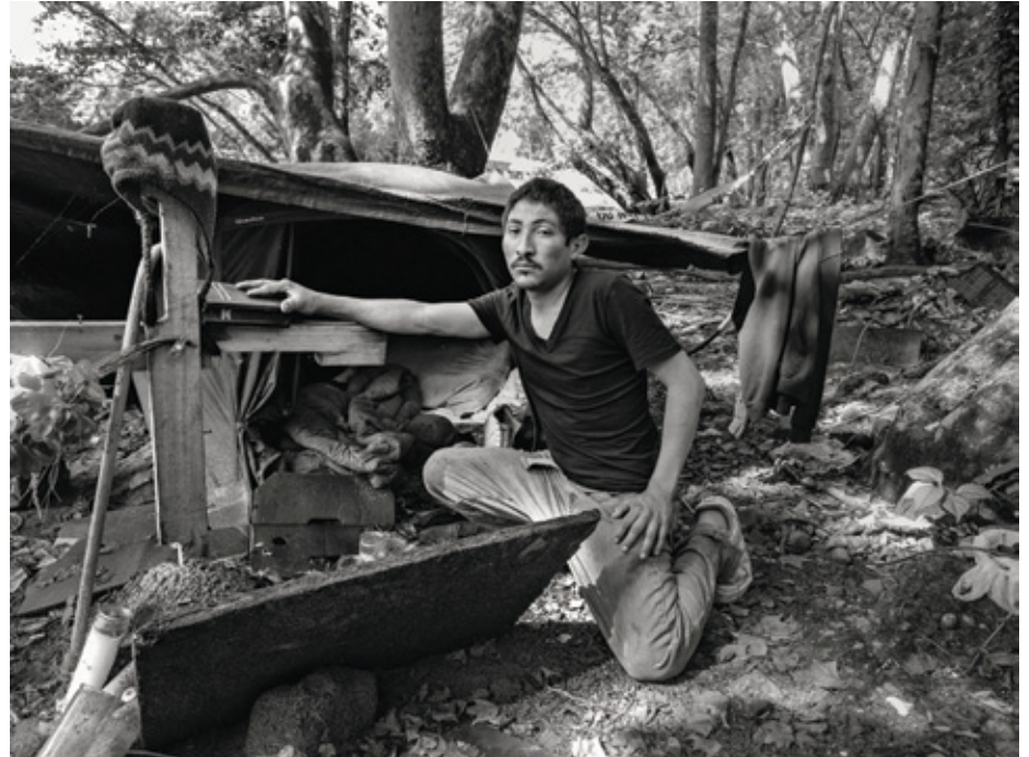
Hector's Memorial, Paterson, New Jersey