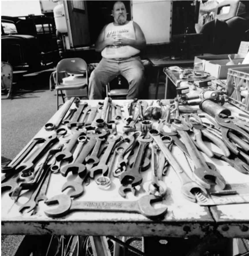
Man with Collection of Wrenches