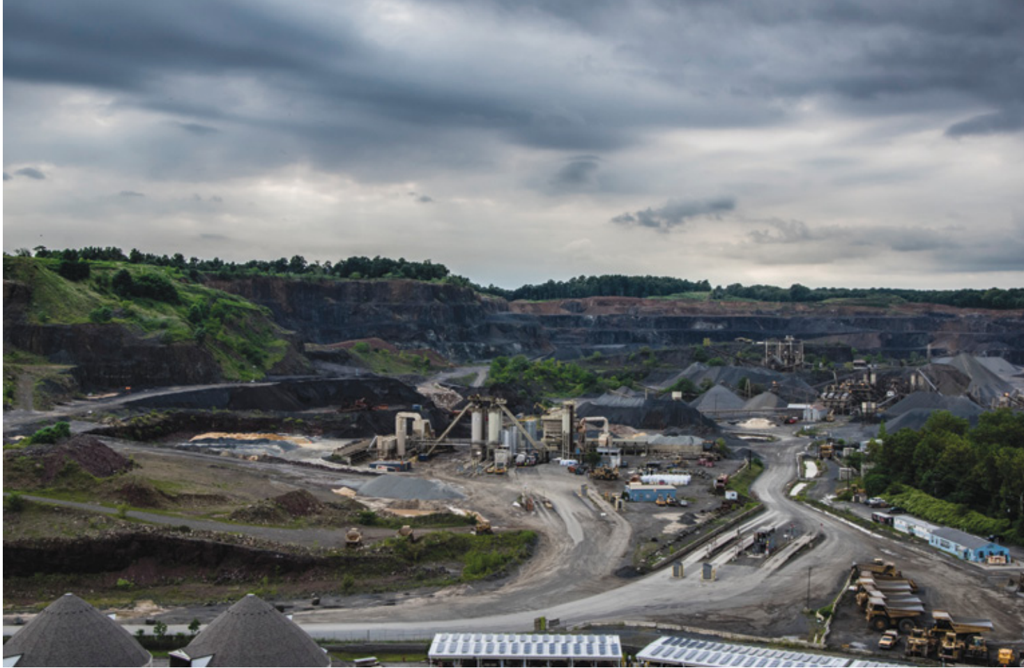
Our Insatiable Appetite