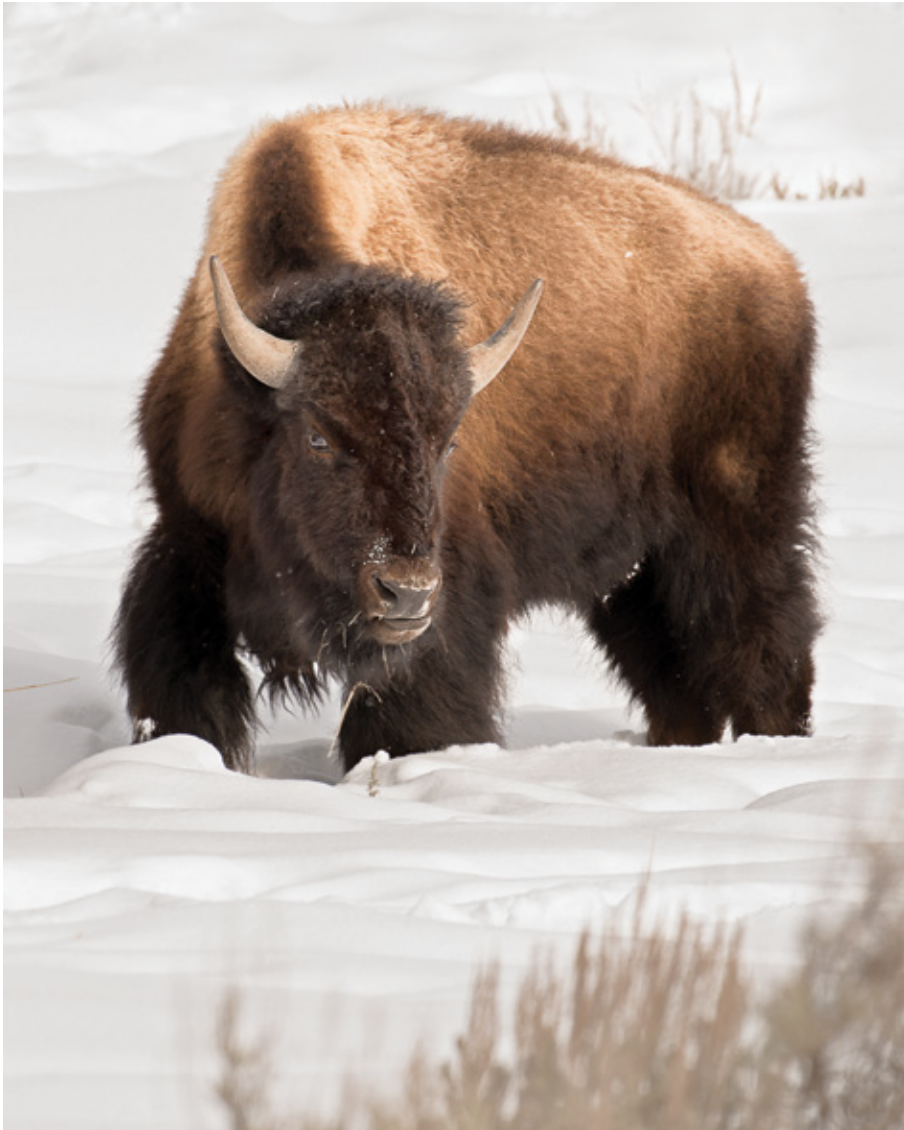
Bison and Snow, Yellowstone National Park