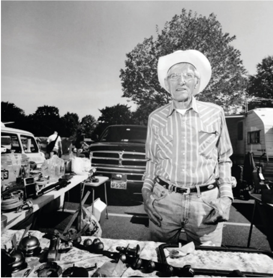
Man with White Cowboy Hat