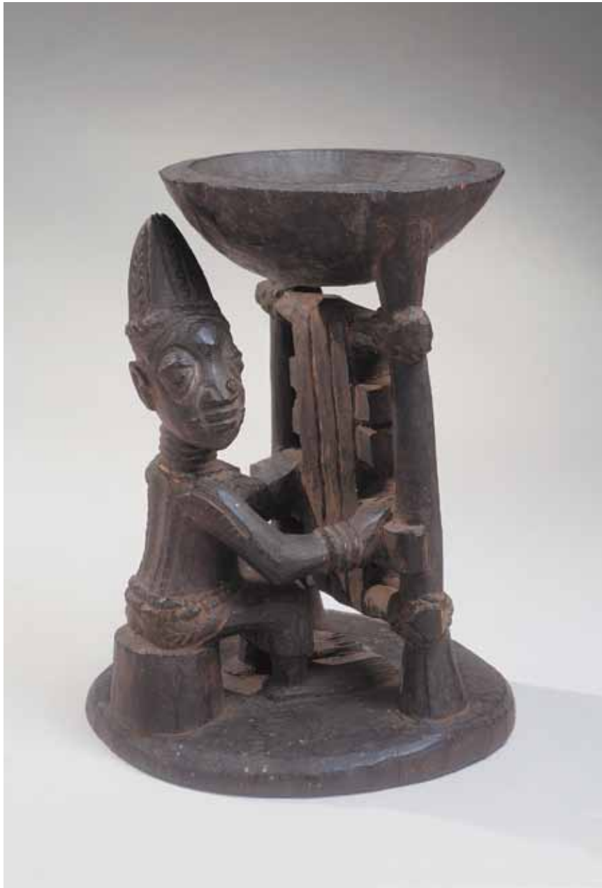
Pl.13 Ifá Divination Container ( agéré Ifá ), 20th century, Nigeria, Wood, 10 1/2 x 7 3/4 x 7 3/4 in.