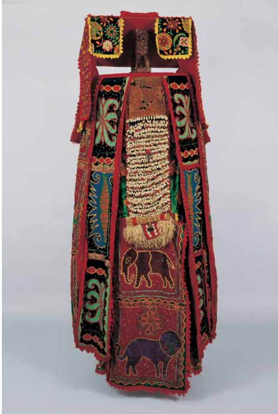
Pl.5 Egúngún Masquerade Costume , 20th century, Republic of Benin, Cloth, wood, cowries, 79 x 37 x 37 in.