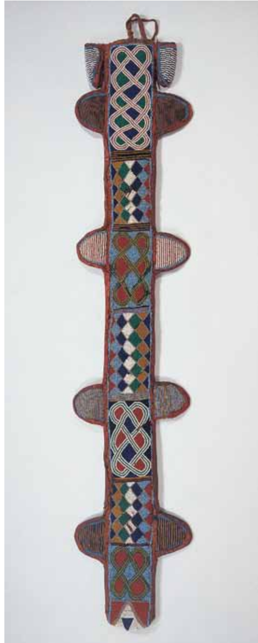
Pl.17 Sheath òpá Òrisà Oko , 20th century, Nigeria Glass beads, cloth, leather, 54 x 11 1/4 x 1 1/2 in.