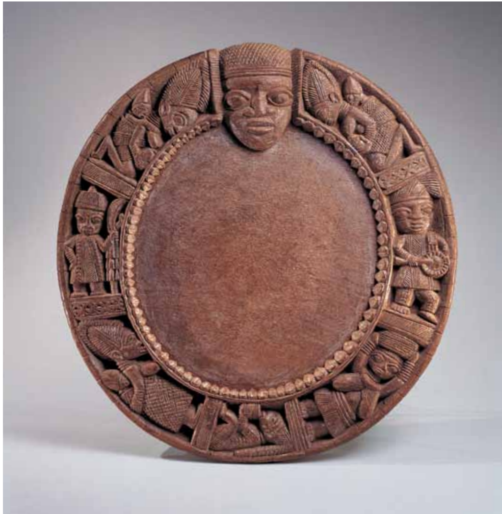
Pl.12 Divination Tray ( opón Ifá ribit ) Attributed to the artist Areogun (ca. 1880–1954) or his atelier Ifá first half 20th century Òsì-Ìlorin, Èkìtì Region, Nigeria, Wood, 21 x 20 x 1 3/4 in.