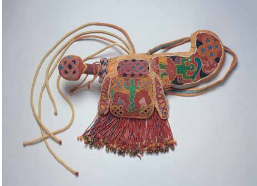
Pl.3 Leadership Sword and Sheath ( udamaloro ), 20th century, Òwò Region, Nigeria, Glass beads, cloth, leather, metal 14 x 21 x 4 in.