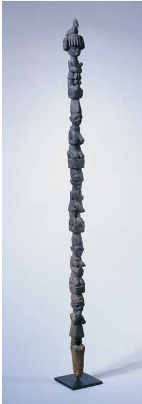
Pl.7 Staff or Post ( òpò ), 20th century, Èkìtì Region, Nigeria, Wood, 56 1/8 x 3 1/2 x 4 in.