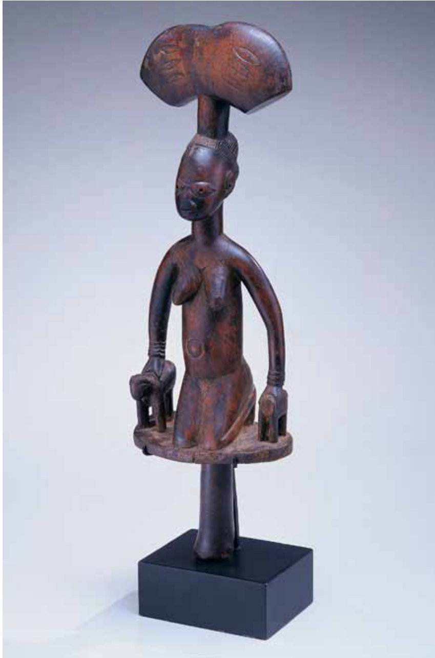
PI.19 Dance Staff for Sàngó (osé Sàngó) , 20th century, Nigeria, Wood, 17 1/2 x 5 x 3 in.