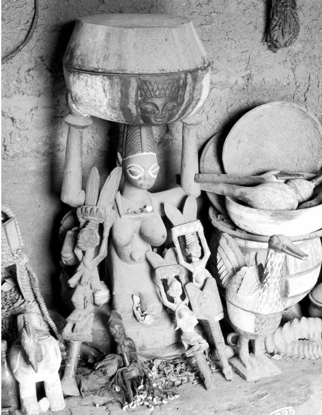
Sangó Shrine, Idofin, Igbana, Nigeria, 1959