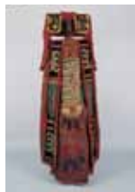
5. Egúngún Masquerade Costume , 20th century Republic of Benin Cloth, wood, cowries 79 x 37 x 37 in. The Newark Museum Purchase 1991 Sophronia Anderson Bequest Fund 91.36