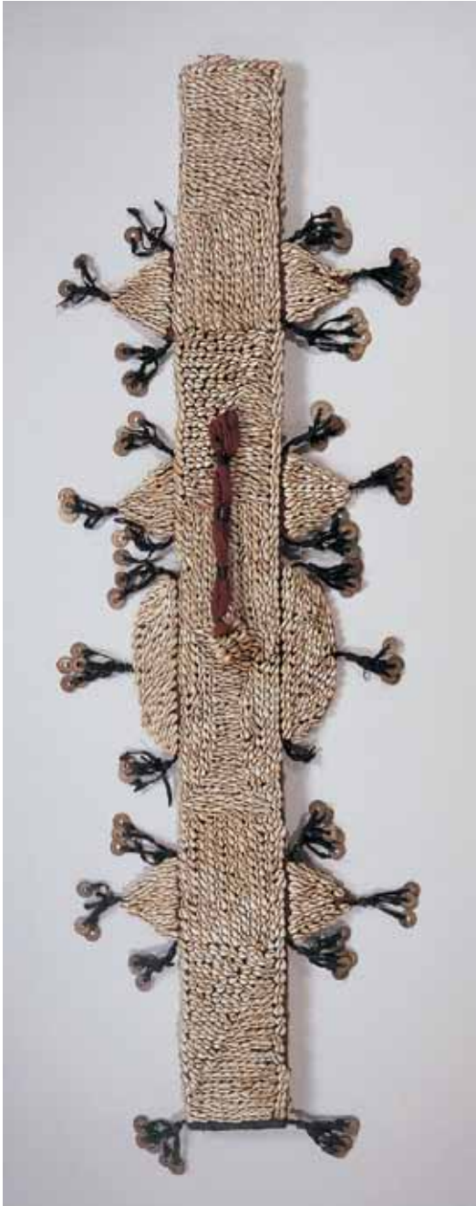
Pl.16 Sheath for òpá Òrisà Oko , mid-20th century, Nigeria Cowrie shells, cloth, leather, metal coins, 49 1/4 x 11 1/2 x 3 1/4 in.