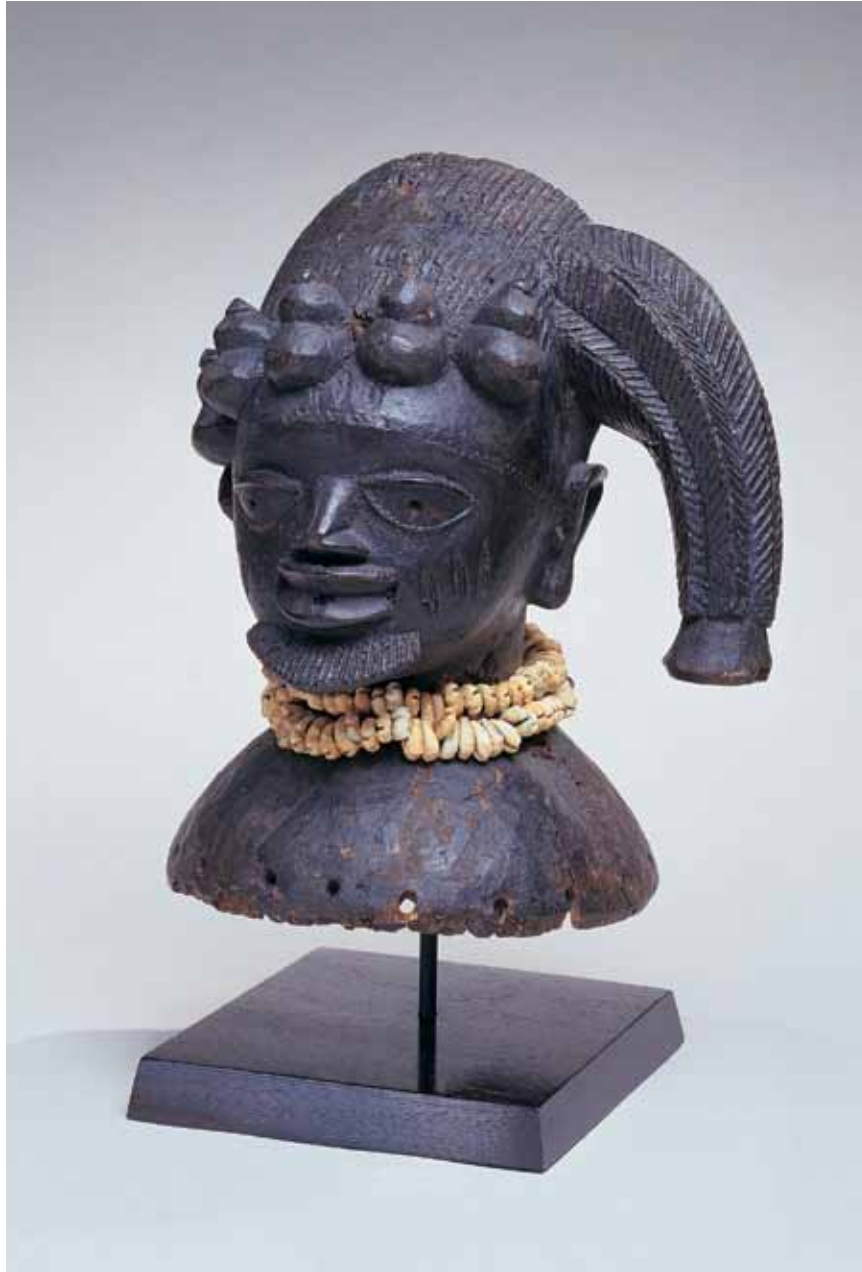
Pl.21 Egúngún Mask , 20th century, Nigeria, Wood, wool, metal, pigment, 12 x 8 x 6 1/2 in.