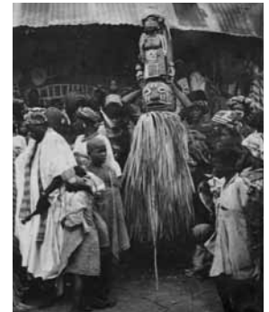
Fig. 9 Epa Masquerades with female motifs associated with fertility and motherhood. Èkiti region, Nigeria. 1960s.