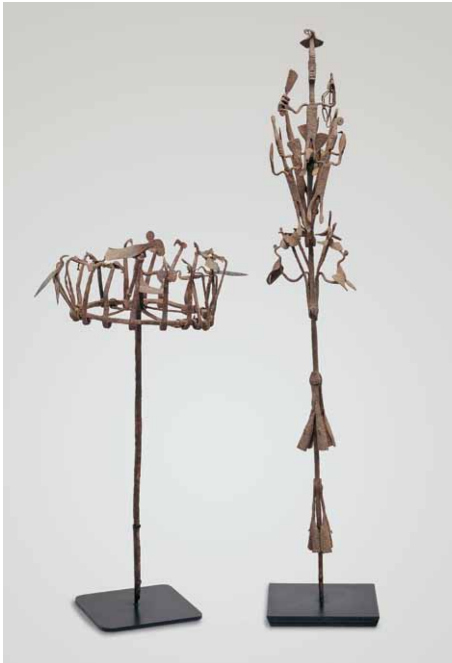
PI.15a. (left) Staff for Òsanyin (òpá Òsanyin), 20th century, Nigeria, Iron, 25 x 11 x 11 in.