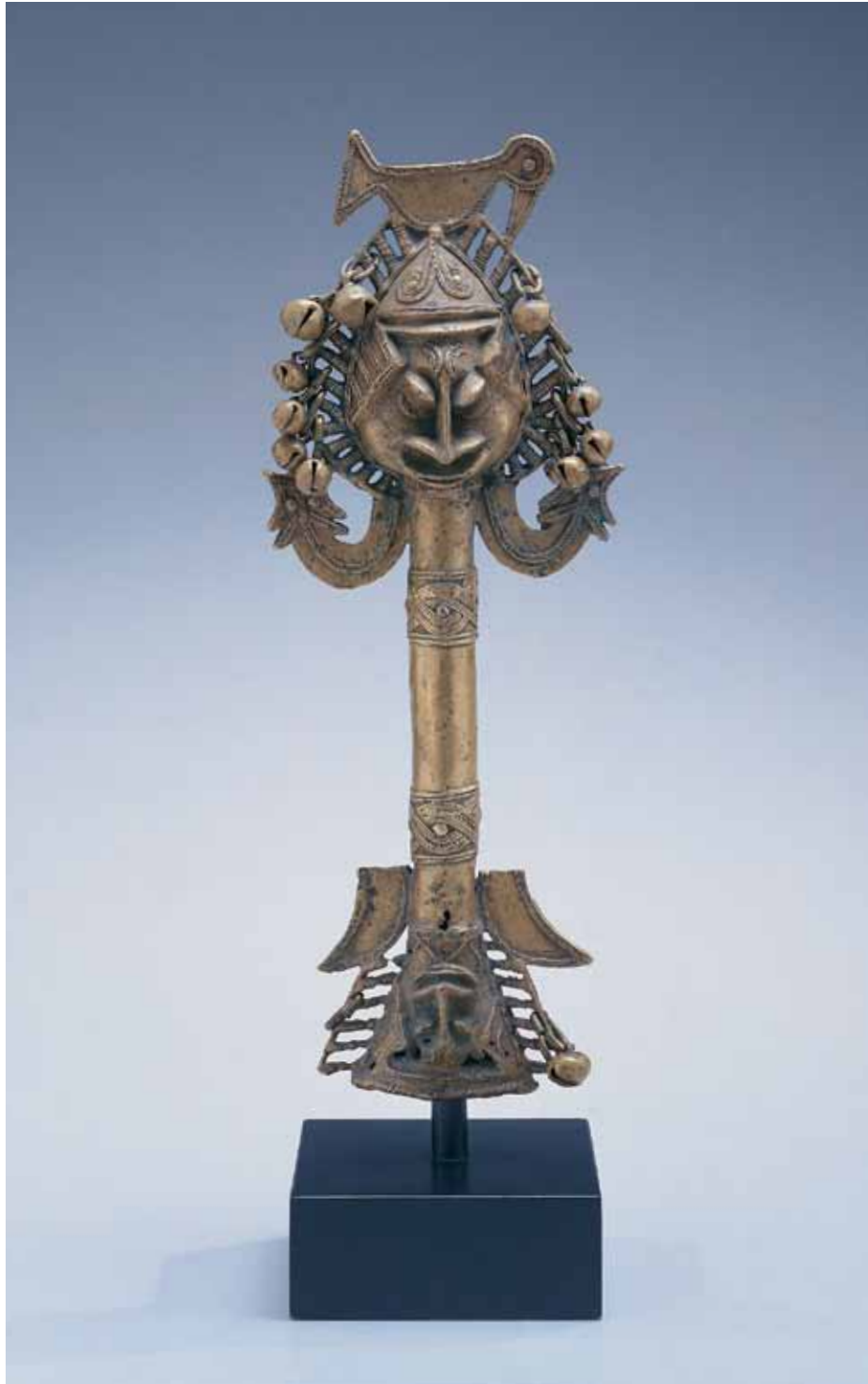
Staff of Authority (Ipawó Àse), Nigeria.