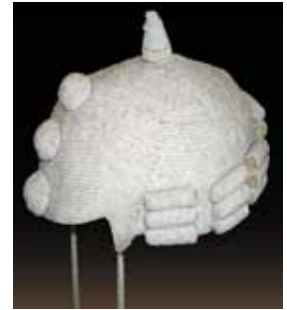
Fig. 4 Crown ( orikògbòfò ), early to mid-20th century, Nigeria, Nigeria

To mark his coronation, a new king may be presented with a brass or iron scepter called idà àse (scepter of authority; pl. 8), indicating that his appointment has been sanctioned by Odùduwà, the divine ancestor. The scepter also identifies him as a judge who has the capacity to resolve or cut through difficult problems. Some kings are known to proffer identical or smaller swords to high-ranking chiefs on the day of their investiture, either as emblems of leadership or to authorize them to act on behalf of the monarch. The example in plate 3 is from the Òwò kingdom. Called udàmalore , it is often worn on the hip during important public ceremonies. Although the designs on the sheath have aesthetic implications, they are expected to increase the ritual potency of the sword as well. 10 In the past, the façade, verandahs, courtyards, and halls of the palace were adorned with carved posts and freestanding sculptures to stress a monarch's position as the head of the body politic. The carved staff in plate 7 has five figures; the female on top (with waist beads) wears a crownlike head-dress surmounted by a bird.