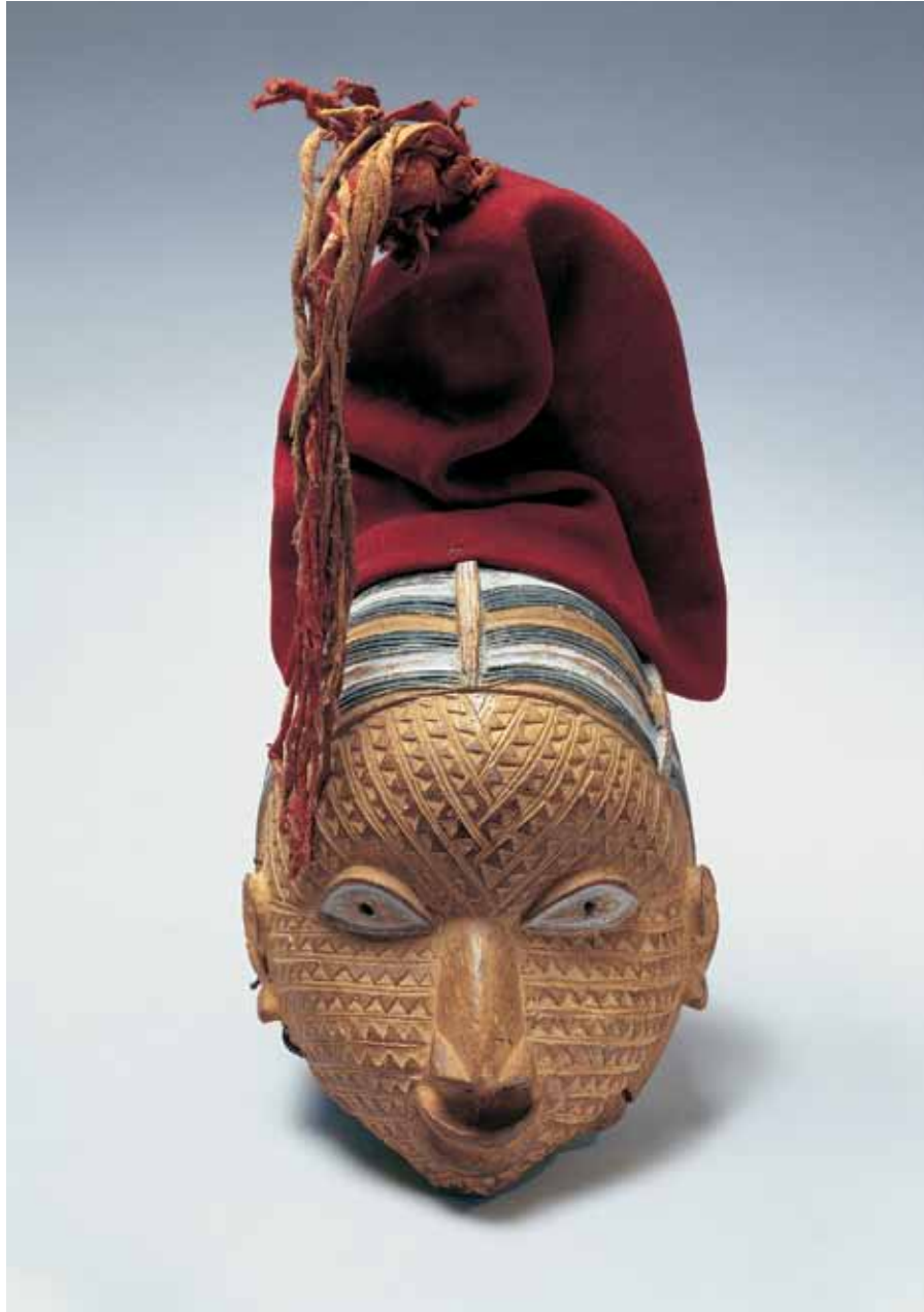
Pl.20 Egúngún Mask , 20th century, Nigeria, Wood, wool, metal, pigment, 12 x 8 x 6 1/2 in