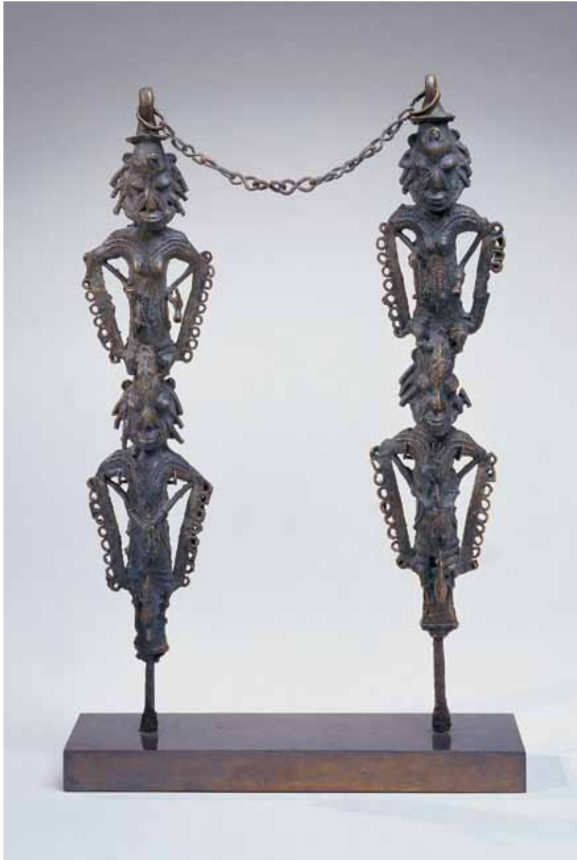
Pl. 10 Pair of Figures ( edan Ôgbón ), 20th century, Nigeria, Brass, iron, 17 x 3 1/2 x 2 1/8 in. (left figure) 17 x 3 1/2 x 2 5/16 in. (right figure)