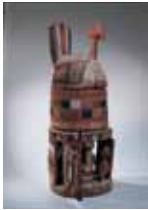
14. Container for a Shrine , late 19th century Nigeria Wood, pigment, metal, mirror 36 5/8 x 14 x 14 in. (overall) The Newark Museum Museum Purchase, 1924 24.495