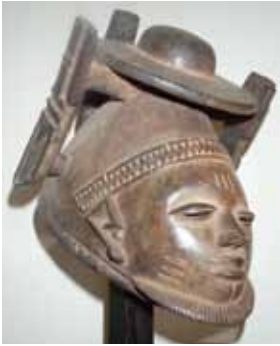
Fig. 8 Gèlèdè headpieces

given community and Ìyá Nlá as well as the àjé , the Gèlèdè society attempts to appease and predispose the latter to use their special endowment for the benefit, rather than the destruction, of humankind. 18 One important aspect of a Gèlèdè masquerade