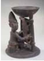
13. Ifá Divination Container (agéré Ifá) , 20th century Nigeria Wood 10 1/2 x 7 3/4 x 7 3/4 in. The Newark Museum Purchase 1981 The Members' Fund 81.492