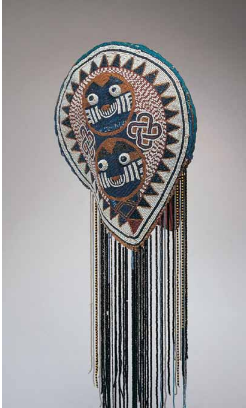
Pl.2 Crown ( adé abetiajá ), 1970s, Nigeria, Glass beads, cloth, thread 34 x 11 3/4 x 9 1/2 in.