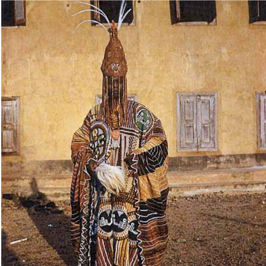
Fig. 6 Oba Ademuwagun II, the Dèjì [King] of Àkúré in the courtyard of palace, Àkúré (Nigeria), 1959.

are treated as one unit and addressed as Ìyá [Mother] and Onílé [Owner of the House]. Moreover, society members frequently call themselves Omo Ìyá; that is, “the Children of the Mother Earth.” Space limitations will not allow an examination of all the implications of this symbolism here. It suffices to say that the edan Ògbóni/Onílé pair reflects not only the interdependence of gender in the perpetuation of life, but the ambivalent nature of Mother Earth as well. For the same goddess who nurtures humanity with water and agriculture takes life at will through different environmental hazards. And since the Yoruba associate femaleness ( abo ) with softness and maleness ( ako ) with harshness, the female aspect of the pair evidently refers to the motherly disposition of the goddess, and the male, to her punitive tendencies—a phenomenon that explains the frequency of figures with hermaphroditic features in Ògbóni/Òsùgbó iconography. Hence the edan pair may be detached and used as a semiotic device to convey important decisions of the Ògbóni society to members and non-members alike. A male figure often has negative connotations such as indicating that an individual has been found guilty of a serious offence or will soon be tried for one by the Ògbóni. A female figure, on the other hand, implies good news such as being appointed a chief, exonerated from false accusations,