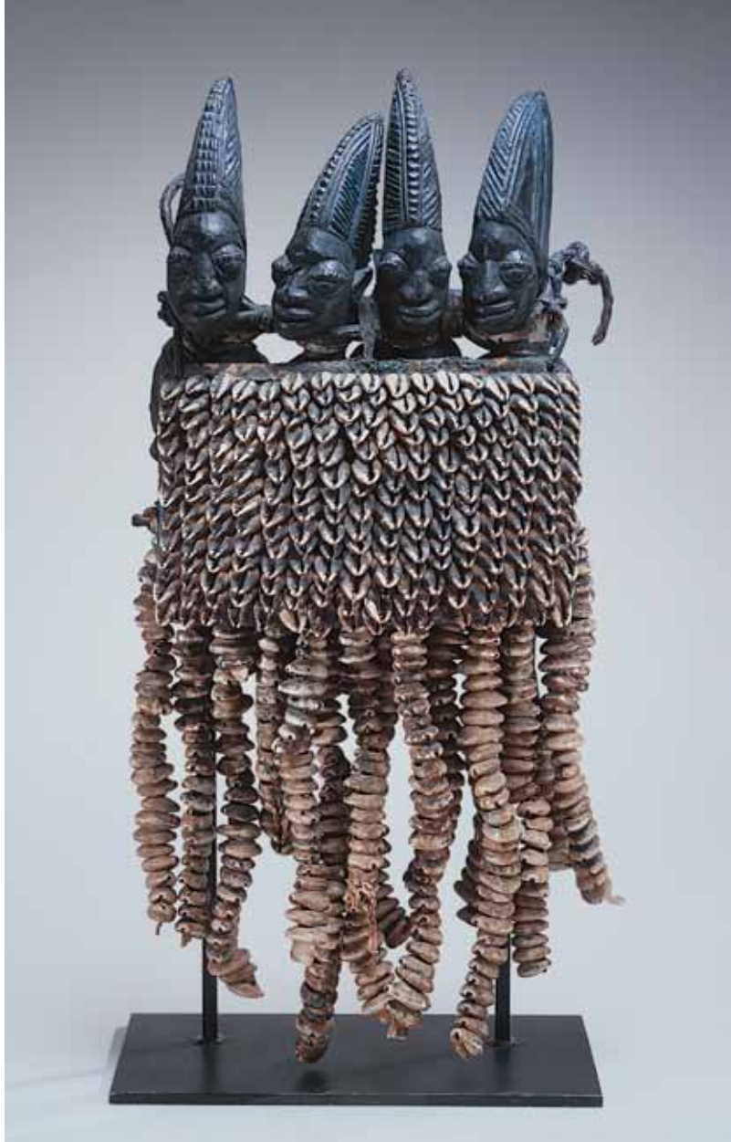
PI.9 Dance Vest with Èsù Figures , 19th–20th century, Igbóminà Region, Nigeria Wood, cowrie shells, leather, pigment, 20 3/4 x 10 x 5 1/2 in.