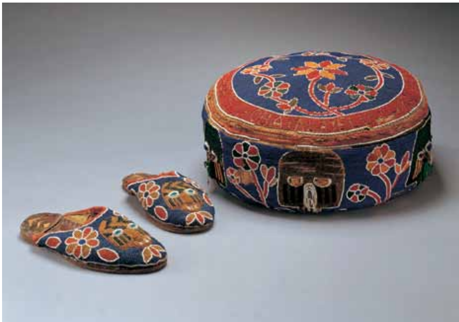
Pl.4a-c Slippers and Foot Cushion , 20th century, Efon-Alaye, Èkìtì Region, Nigeria, Glass beads, leather, thread 2 1/2 x 4 1/8 x 10 in. (each slipper); 7 1/2 x 19 1/4 x 19 1/4 in. (cushion)