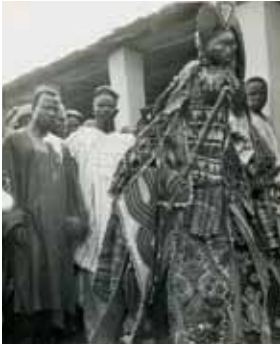
Fig. 7 Egúngún masquerade with hunter's hairdo ( ààso olúode ), Àbèòkúta, Nigeria, 1970s.

or granted special favors by the Ògbóni society. Yet, in other contexts, especially when worn on the body, the male figure is expected to bring strength and vigor to a sick members, and the female, to ease pain or relieve tension.