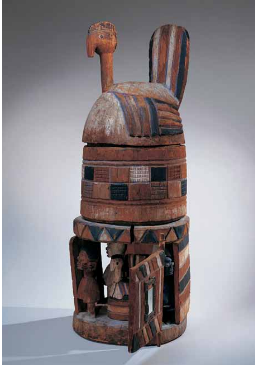
Pl. 14 Container for a Shrine , late 19th century, Nigeria, Wood, pigment, metal, mirror, 36 5/8 x 14 x 14 in. (overall)