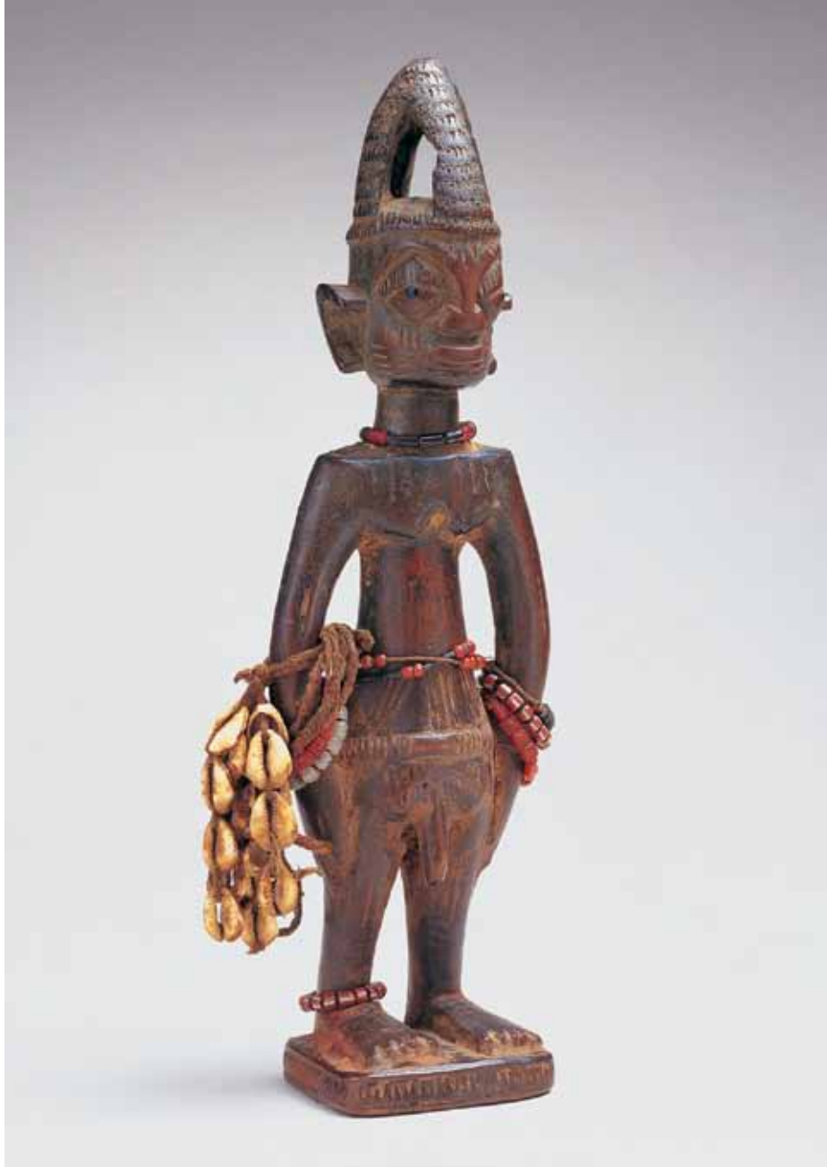
Pl.6 Male Twin Figure (ere ibeji) , 20th century, Nigeria, Wood, cowries, leather, beads, 12 x 4 1/2 x 2 1/2 in.