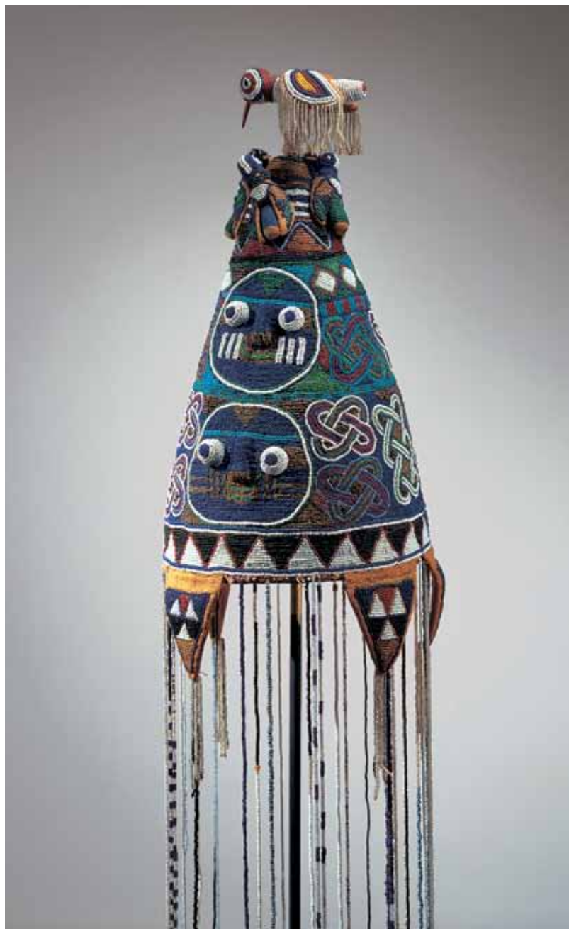
Pl.1 Crown ( adénlá ), 20th century, Nigeria, Glass beads, fiber, cloth, thread 54 1/2 x 8 x 8 in.