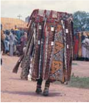
Fig. 5 Egungun-alábala/pàràkà , Òyó, Nigeria.1986

only to allude to the wealth that farming can generate but also to support the legend that he was one of the ancient kings of the town of Iràwò.