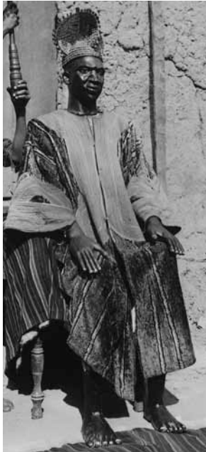
Fig. 2 Second burial effigy ( àkò ) representing the chief of a village near Òwò (Nigeria) partially dressed, 1949