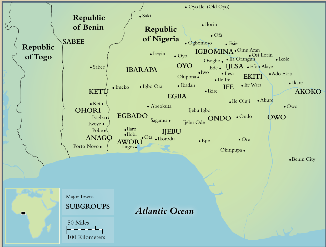
Map of Yorubaland, showing major towns (e.g. Ilé Ifè) and subgroups (e.g. Ifè)