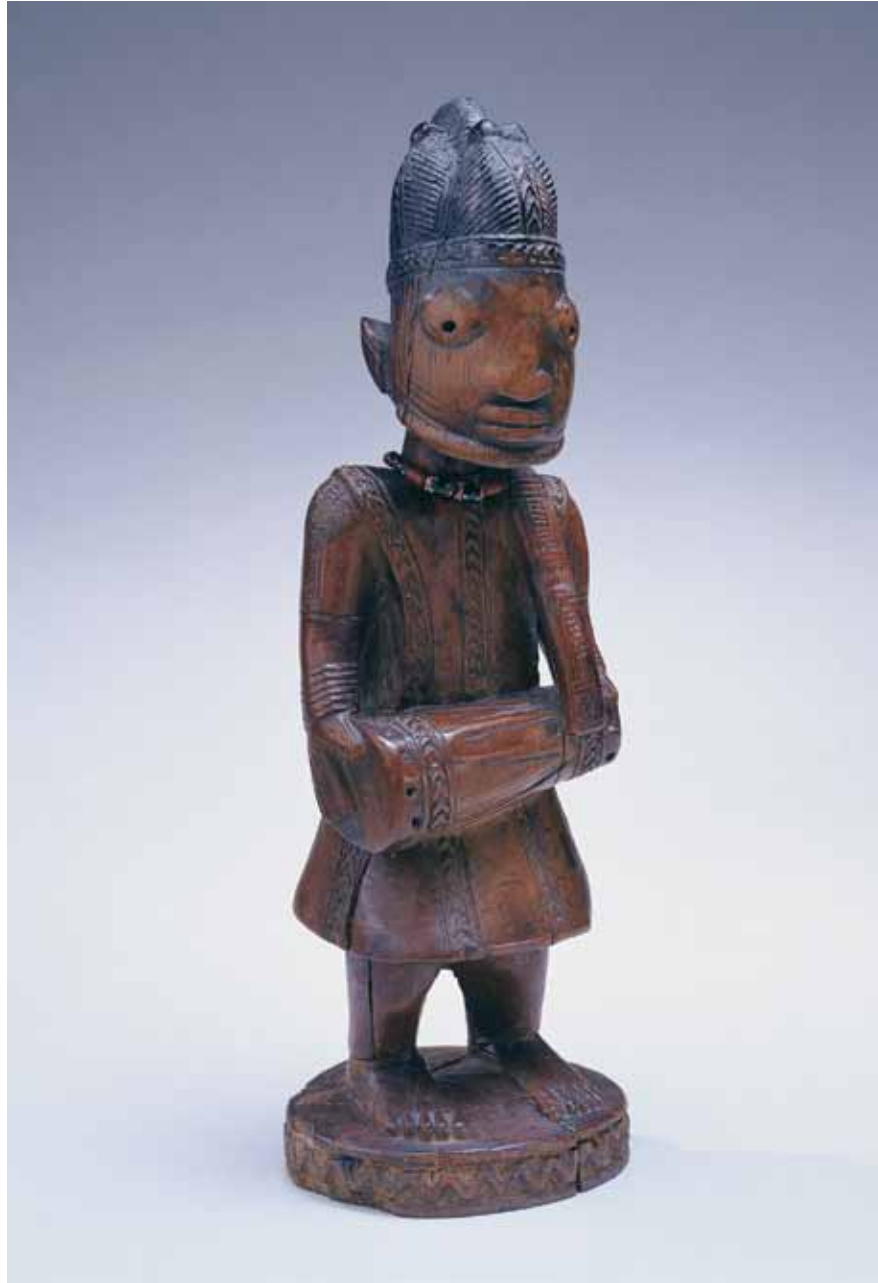
Pl.18 Figure of a Bata Drummer (alubata) , 20th century, Nigeria, Wood, pigment 13 3/4 x 4 1/2 x 4 1/4 in.