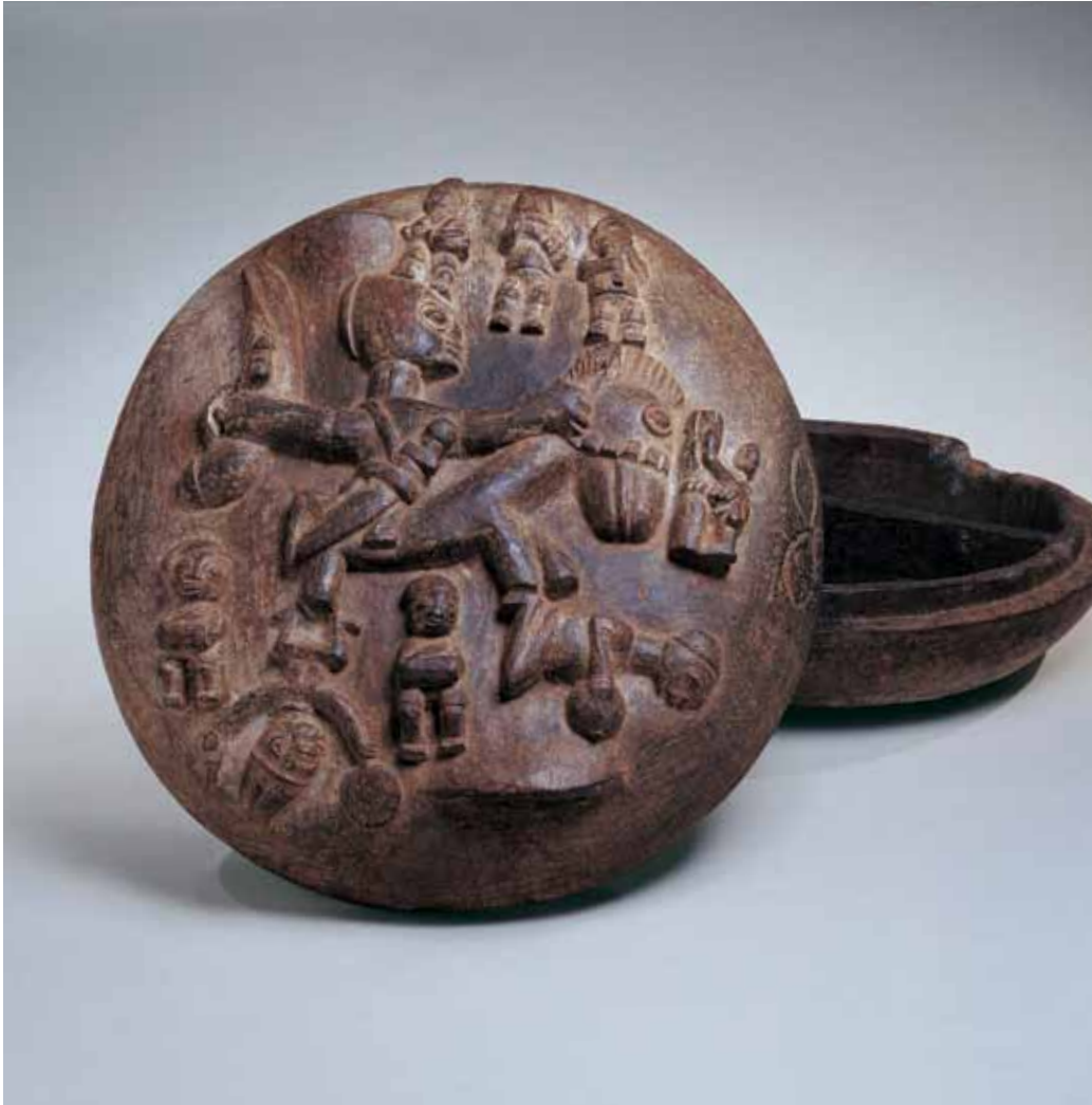
PI.11 Container for Sàngó Altar , 20th century, Nigeria, Wood, 8 x 19 x 19 in.