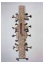
17. Sheath for òpá Òrìsà Òkò , mid-20th century Nigeria Cowrie shells, cloth, leather, metal coins 49 1/4 x 11 1/2 x 3 1/4 in. The Newark Museum Purchase 1980 John J. O'Neill Bequest Fund 80.424