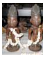
24a–b. Pair of Twin Figures (ère ibejì) , mid to late 19th century Nigeria Wood, beads, cowries h. 9 3/4 in. The Newark Museum Museum Purchase, 1924 24.538, 24.539