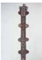
18. Sheath òpá Òrìsà Òkò , 20th century Nigeria Glass beads, cloth, leather 54 x 11 1/4 x 1 1/2 in. The Newark Museum Purchase 1980 John J. O'Neill Bequest Fund 80.425