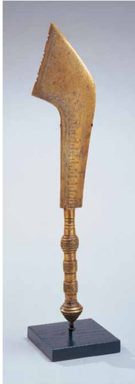
Pl.8 Sword of Authority ( idà àse ), 19th–20th century, Nigeria, Brass, length 22 x w. 5 1/4 x d. 1 3/4 in.