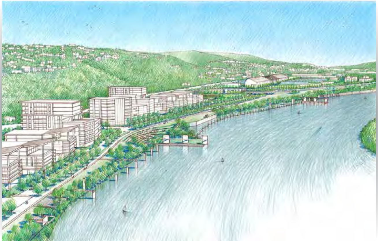
A concept drawing of the Hazelwood Green development

importantly, Hazelwood Green is meant to be not only in but of Hazelwood. The planning of the site is meant to seamlessly blend it in with the neighborhood and the funding made available for community development. But the project, having started with the 2002 purchase, is only now beginning to take concrete shape and enter the implementation phase. Although some point to far greater than expected environmental remediation costs and requirements, others believe that a lack of expertise in development,