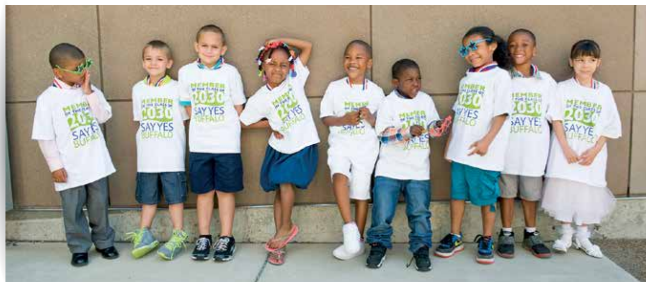
Students in the Say Yes to Education program

The program recognizes a general economic development principle that, perhaps, is even truer in New Jersey: a strong school district is,