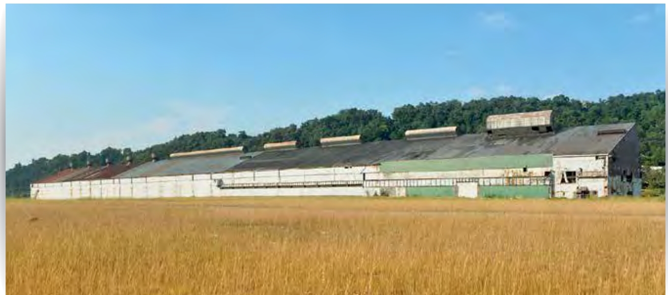
The abandoned LTV site, the last and largest brownfield in Pittsburgh

One of the first and most famous redevelopment sites in the region was Homestead, which was the site of one of Andrew Carnegie's first huge steel mills — as well as one of the worst episodes of labor unrest in American history. While the Homestead development brought jobs and business activity back to the city, some say that it did not do the same for the community. Today, the mill site is a very large shopping complex, made up mostly of big box stores and their parking lots. The site is firmly on the other side of the city's central business district, which is separated by a busy road. Other brownfields in the region, particularly those further from