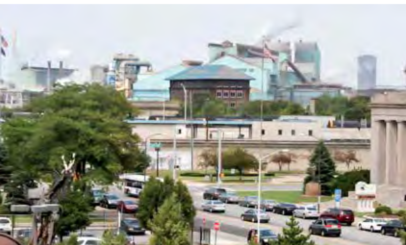
Gary, Indiana - Against Lake Michigan, U.S. Steel Gary works in the background with the city spread out in the foreground.

Today, Gary is still home to the largest steel mill in North America and dozens of factories line the shore of the lake. Even though the mill is churning out more steel than ever, the plant's need for 30,000 employees as late as the 1970s has declined to just around 5,000 today — mirroring the city's own population decline to 76,000 and the national trend of a shrinking industrial workforce. While a statue of Judge Gary still stands in front of City Hall and the mill looms over the downtown, the company's corporate presence has receded from the city almost entirely.