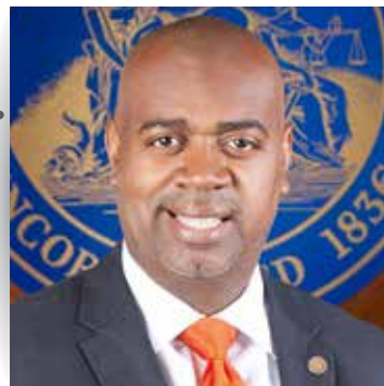
Mayor Ras Baraka of Newark

JSWIPP*: How would you describe the benefits of mayor-appointed and elected school boards?