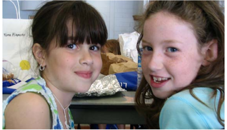
Two of the reading champs enjoy their brown-bag lunch in Downs Hall after the presentation in Wilkins Theatre.